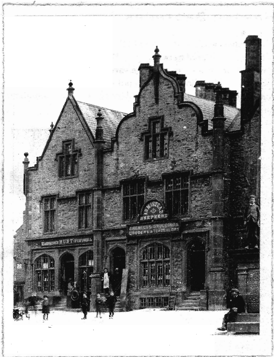
Armistead & Shepherd, Town Hall, Settle, 1880s