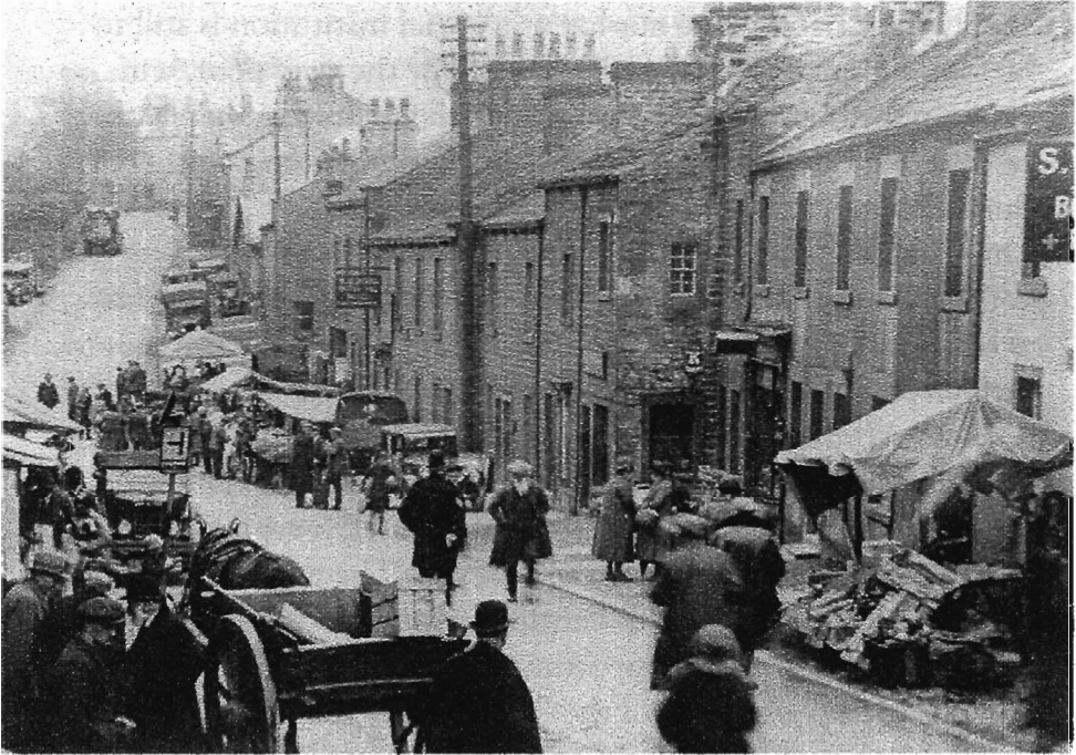
Market Day, High Bentham Main Street, 1920s

Exhibition at the Museum of North Craven Life The Folly, Settle, North Yorkshire, 2004