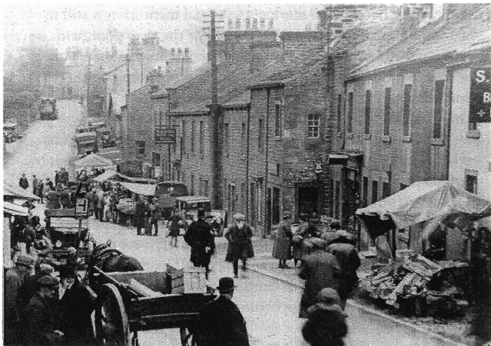
Market Day, High Bentham Main Street, 1920s

Exhibition at the Museum of North Craven Life The Folly, Settle, North Yorkshire, 2004